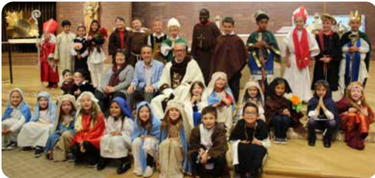
2019 All Saints Day