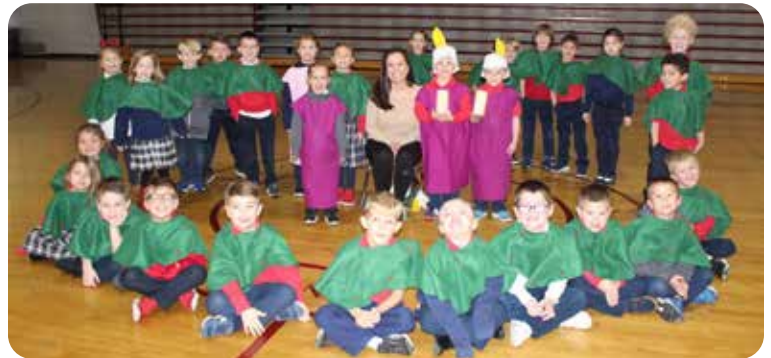
2019 Advent Service