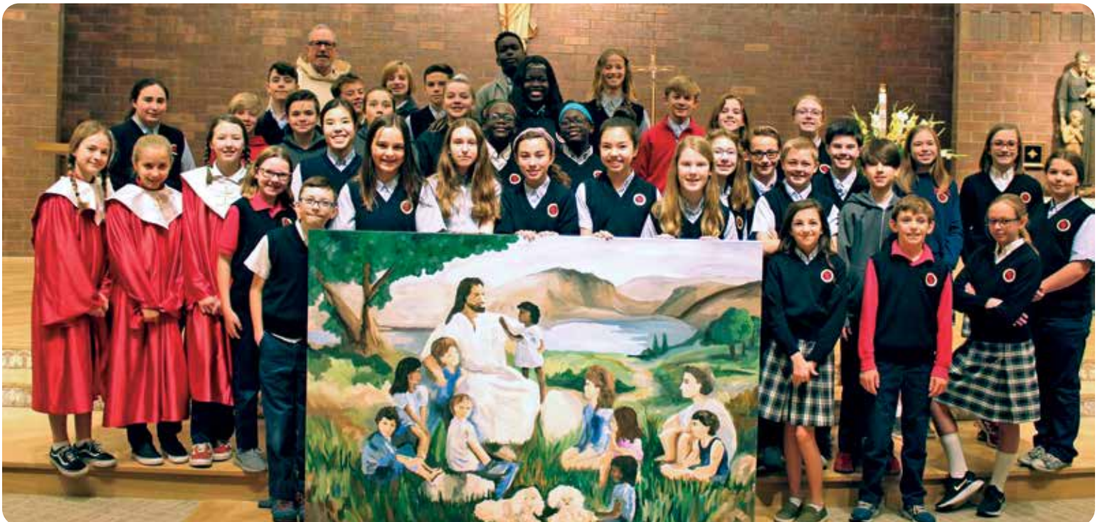
Let the Children Come to Me