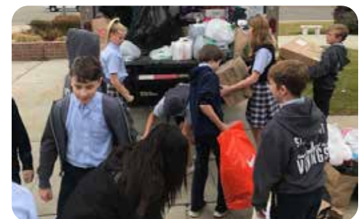
CCS Clothing Drive