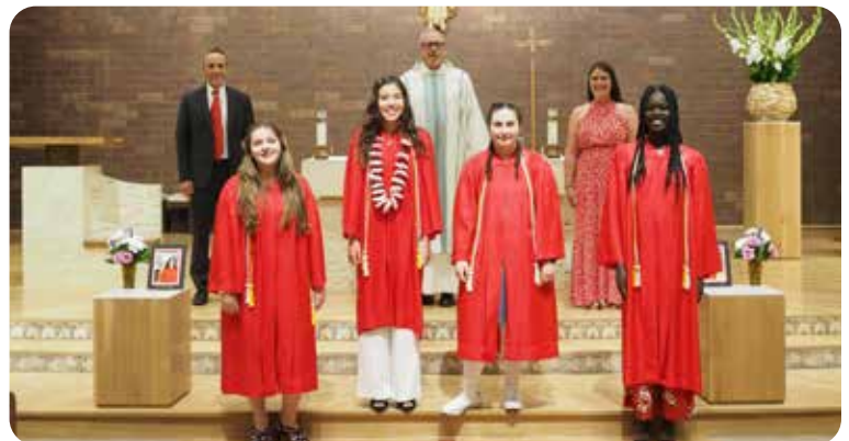
St. Vincent Graduating Class of 2020